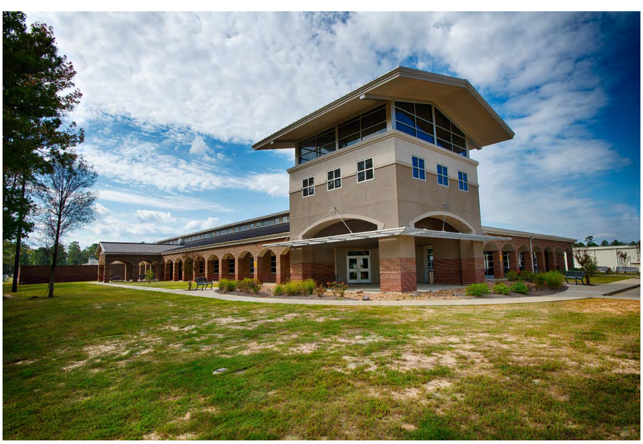
*PROJECTS indicate the number of projects the Architect submitted an RFQ