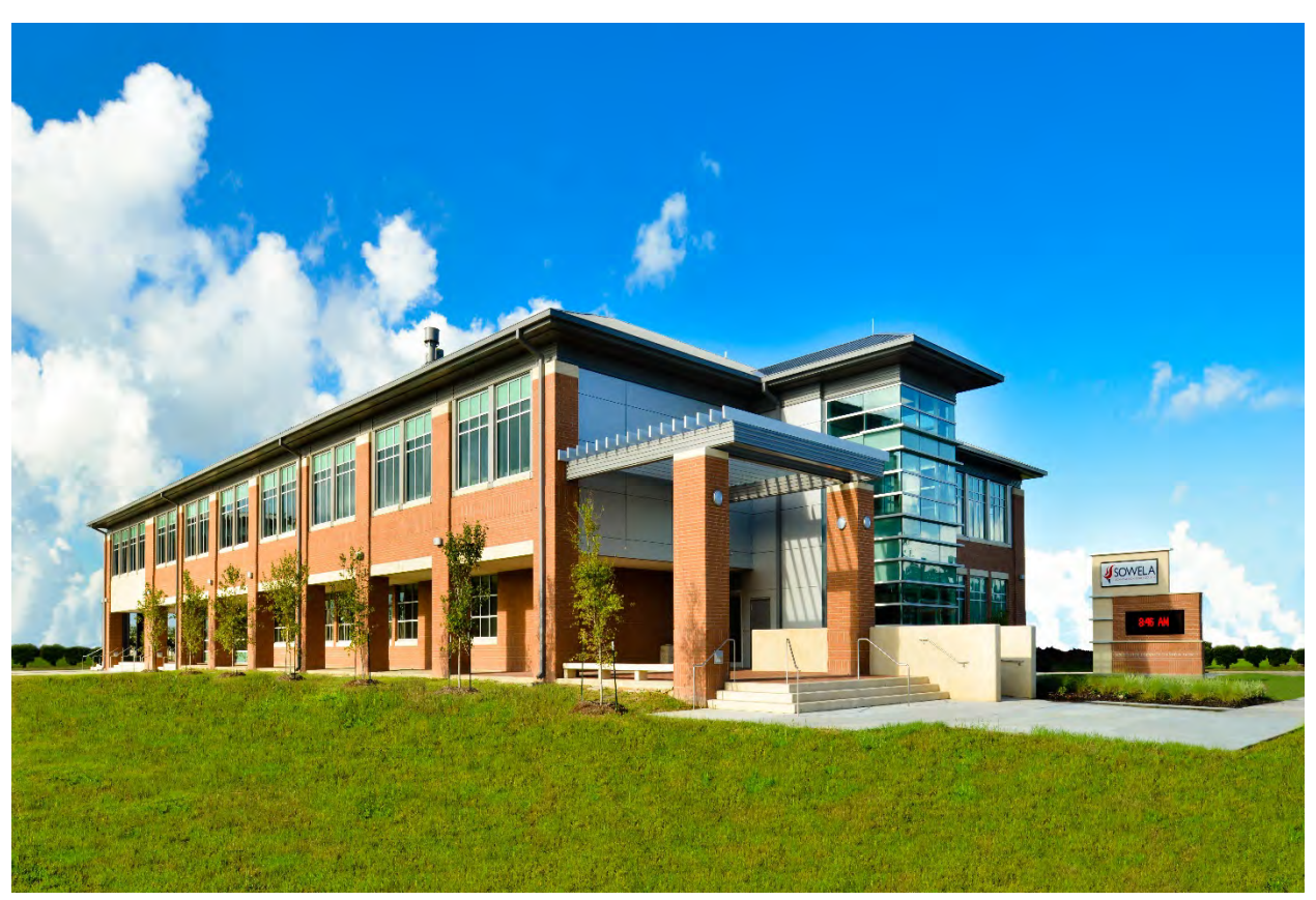
*PROJECTS indicate the number of projects the Design-Builder submitted an RFQ