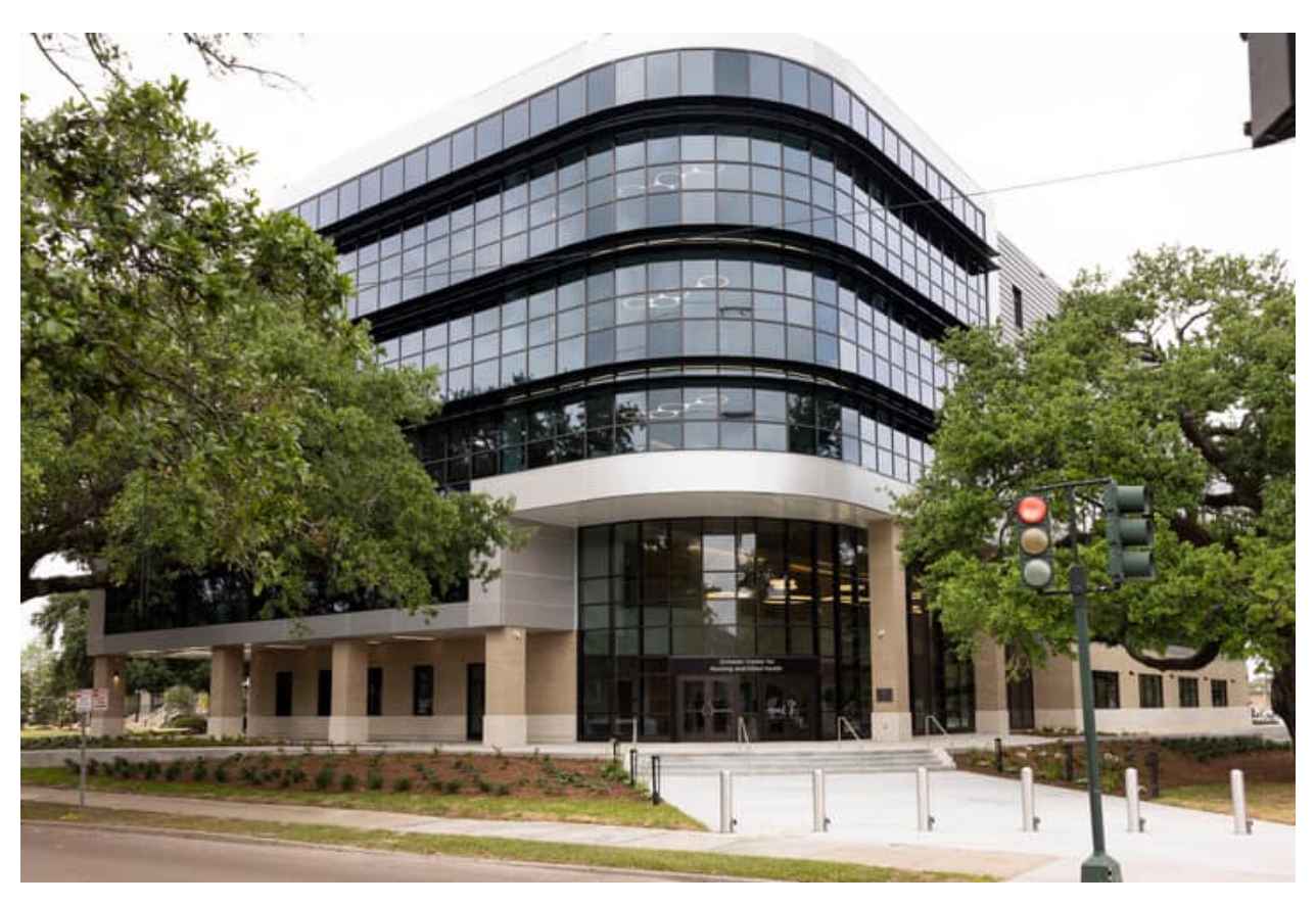
*PROJECTS indicate the number of projects the Design-Builder submitted an RFQ