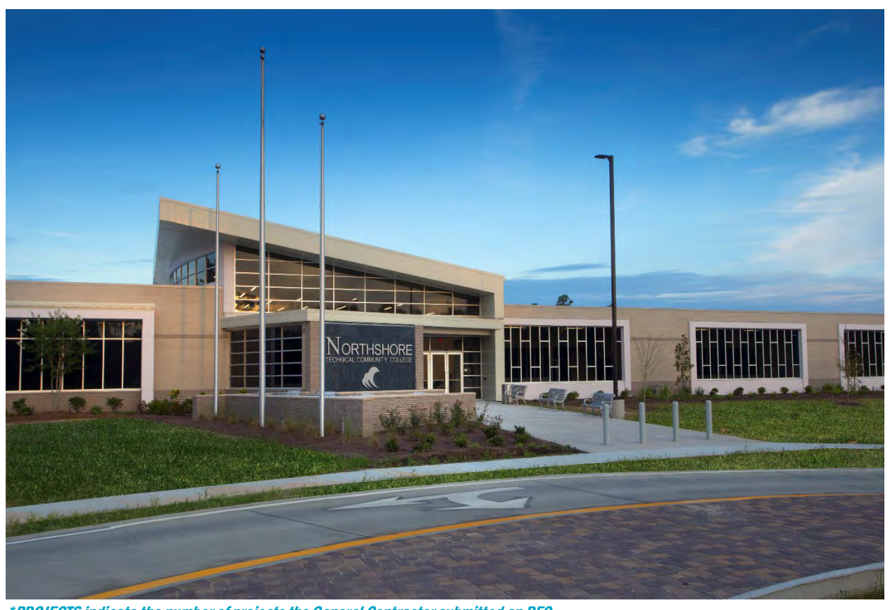
*PROJECTS indicate the number of projects the General Contractor submitted an RFQ