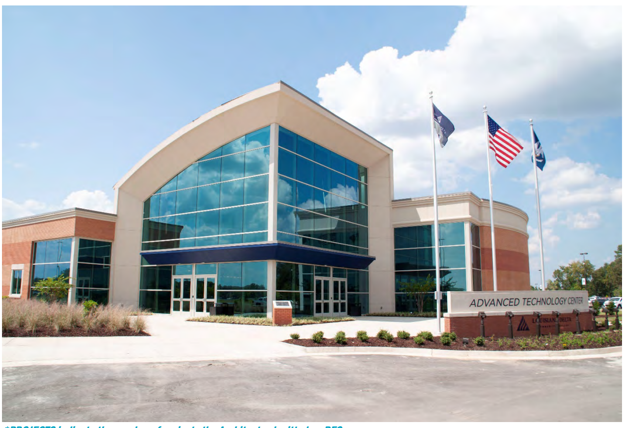
*PROJECTS indicate the number of projects the Architect submitted an RFQ