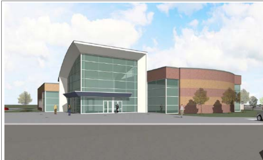
RENDERING PROVIDED BY ARCHITECTURE + (DESIGN SUBJECT TO CHANGE)