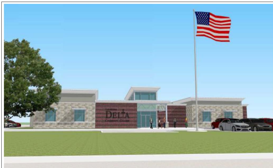
RENDERING PROVIDED BY TBA STUDIO (DESIGN SUBJECT TO CHANGE)