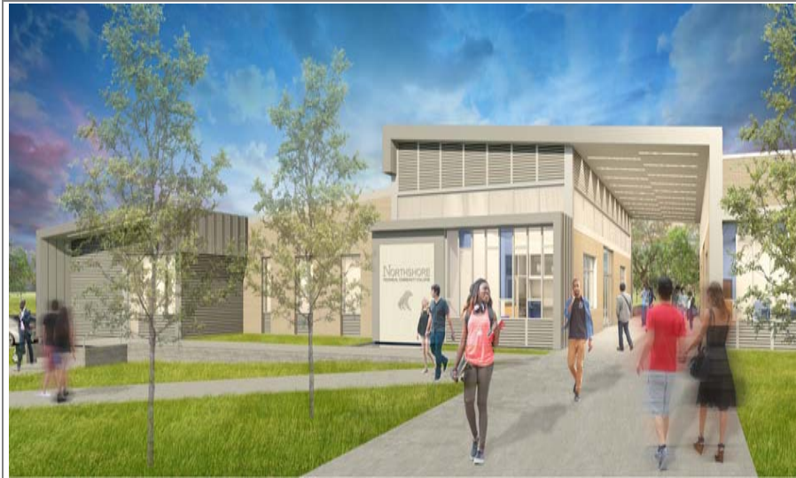
(DESIGN SUBJECT TO CHANGE)