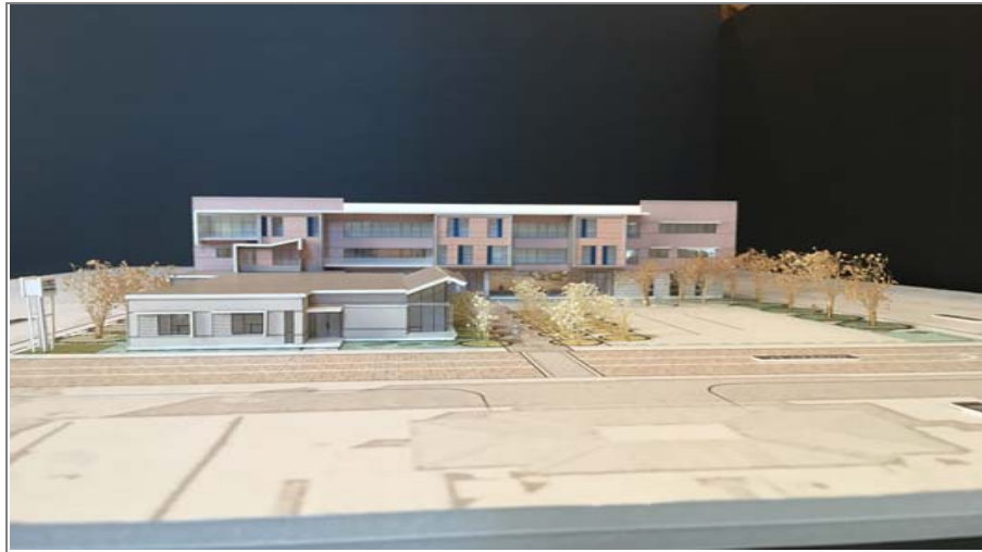
RENDERING PROVIDED BY BHB | ABW, A JOINT VENTURE