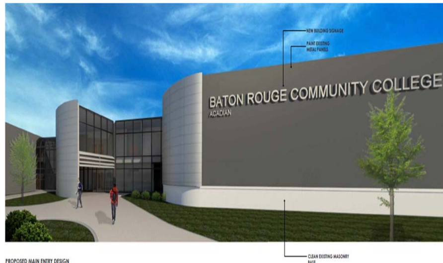
PROPOSED MAIN ENTRY DESIGN